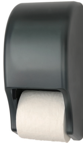
Model 28 Twin Vertical Standard Roll Tissue Dispenser

Dispenses universal rolls with a diameter up to 5.125" and roll widths up to 4.50" Width 6.02" Height 13.13" Depth 6.00"