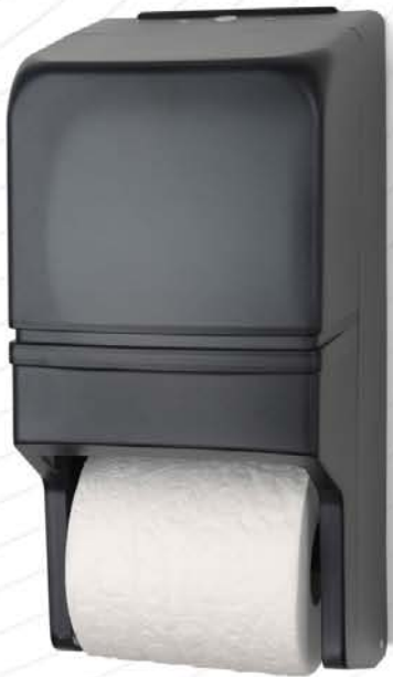
Model 25 Twin Vertical Standard Roll Tissue Dispenser