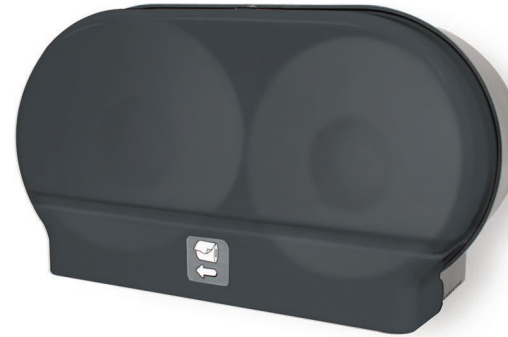
Model 321 Twin Horizontal Standard Roll Tissue Dispenser

Dispenses universal rolls with a diameter up to 5.4" and roll widths up to 4.50" Width 6.02" Height 13.04" Depth 6.16"