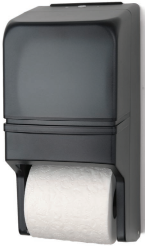
Model 25 Twin Vertical Standard Roll Tissue Dispenser

Dispenses universal rolls with a diameter up to 5.125" and roll widths up to 4.50" Width 6.02" Height 13.13" Depth 6.00"