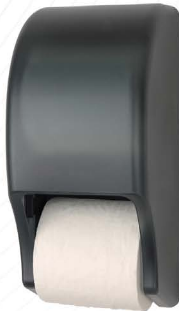
Model 28 Twin Vertical Standard Roll Tissue Dispenser